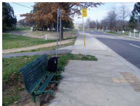
A lonely bus stop close to the heart of Canberra. No shelter or timetable but an interesting seat.