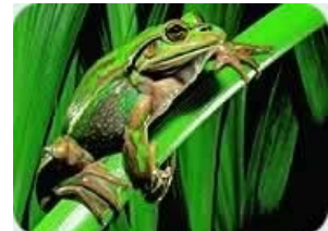
Green & Golden Bell Frog, Litoria aurea

"It was listed as endangered under the New South Wales Threatened Species Act and is classified as vulnerable nationally. ... The Green and Golden Bell Frog has a distinctive three-part call that sounds a bit like a motor bike changing gears."