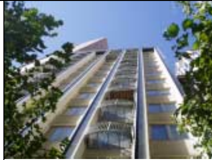
The Mark Building