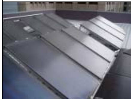
Solar hot water collectors