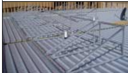
Rooftop mounting frames