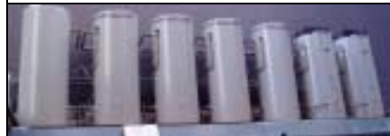
Solar and gas storage tanks